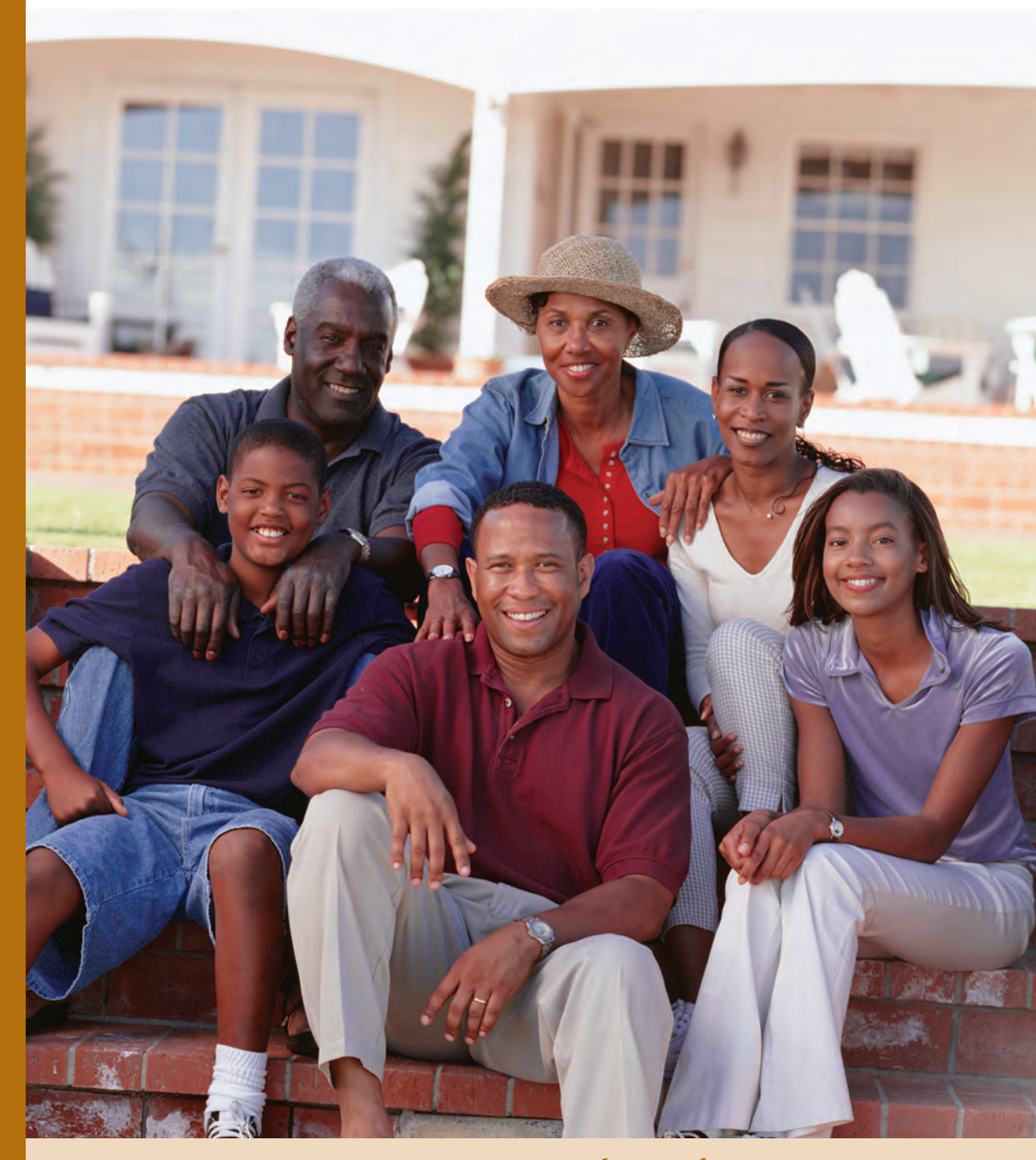
Maximize your estate, conserve and transfer assets to the ones you love.