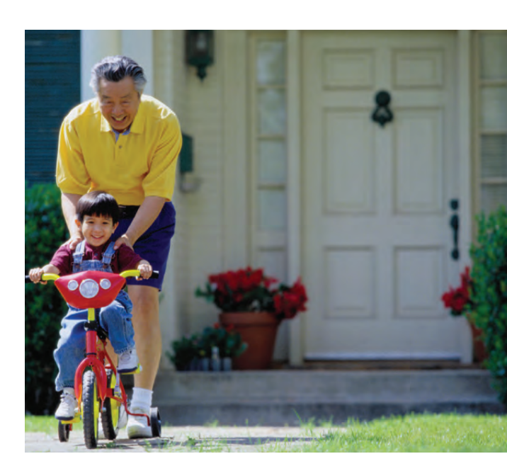
Ensure your heirs get what you want for them